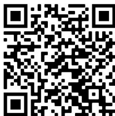
Scan for a list of Virtual Meetings